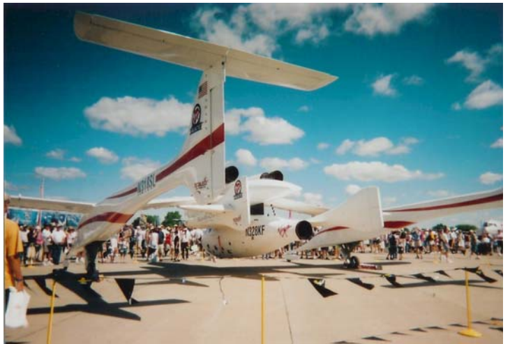
White Knight and Space Ship One.