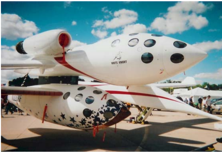
Burt Rutan's White Knight stole the show.