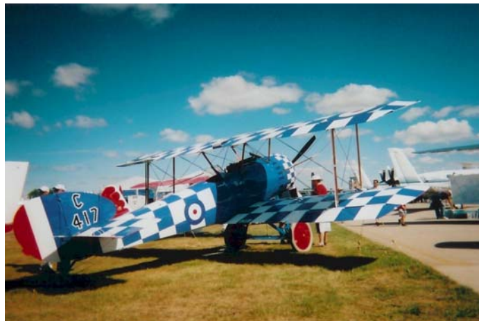
A warbird from a different era.

Looking ahead, our next big event is the Chapter Picnic at Winemiller Farms International. Continue to remember that safety is up to all of us that fly. So, fly safe and hope to see you at the picnic.