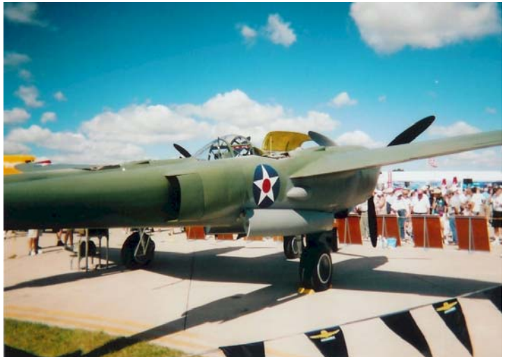
Glacier Girl made an appearance this year.