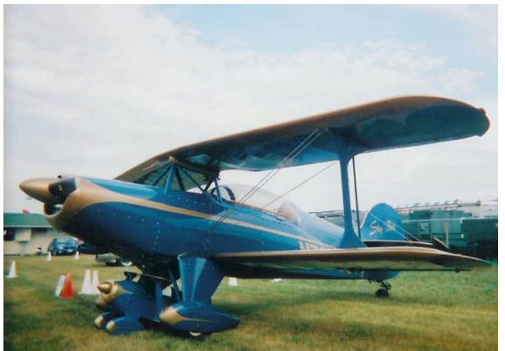
Skybolt and offspring.