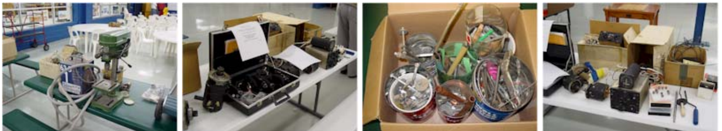
Some of the many great buys auctioned off at the October meeting