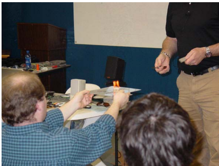
Let there be fire – on the first strike!

The new Ohio health and food safety codes require a list of all ingredients to be attached to all home baked and homemade goods sold at fund raising events. Thanks for bringing the list in duplicate anytime we have a bake sale.